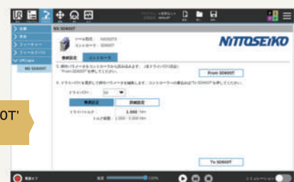
URCap 'NS SD600T' screen images

URCap "NS SD600T" enables easy installation setups on UR teach pendant and simple intuitive configuration of screwdriving parameters (torque value, rotation speed, etc.) stored on "SD600T" controller.